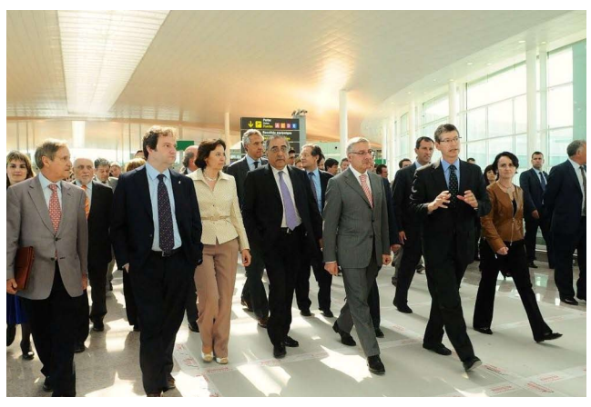
Minister of Development José Blanco, accompanied by other authorities visiting the new terminal.

T1 has got solar panels, a total of 696 to be precise, each 2.2 m<sup>2</sup> in size. Seventy percent of the terminal's sanitary water is heated by thermal collectors.