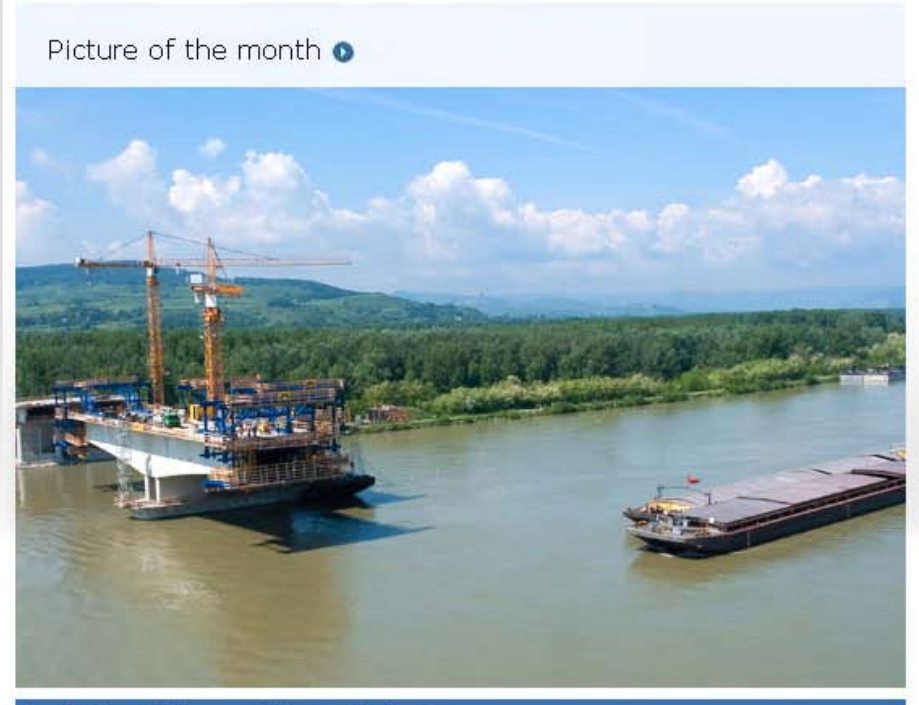
Construction of Traismauer Bridge over the Danube.

Home Contract Awards Finished projects ALPINE Events CSR Current events Employees