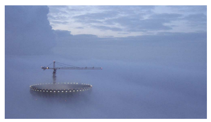
Neurath Power Plant.

Every year SOLID gives out the SOLID Construction Technology Prize. An independent panel of judges evaluates the designs submitted in the national and international categories and rewards excellence in building technology.