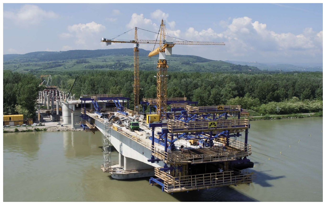
Construction of Traismauer Bridge over the Danube.