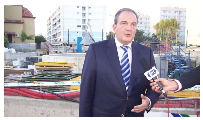
Prime Minister Kostas Karamanlis visiting the site.

In 2007 Kerameikos and Egaleo stations went into operation as well. By year's end Peristeri, Anthoupoli and Haidari stations will throw open their doors. They are expected to handle more than 75.000 passengers per day.